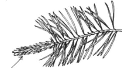
Young pine leaves