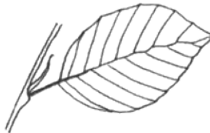
Young beech leaves