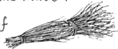
Bundles of peasticks